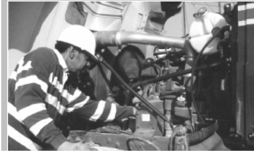
Figure 5-3: The CDP should have a good working knowledge of the engine's electrical system.

The primary functions of the electrical system are to provide power for starting the vehicle and a power source for various electrical components on the truck mixer, including gauges and lights. Wiring can be a source of extensive downtime if not properly maintained. Acid and large amounts of water are used to clean truck mixers. They can cause damage to wiring and other electrical system components.