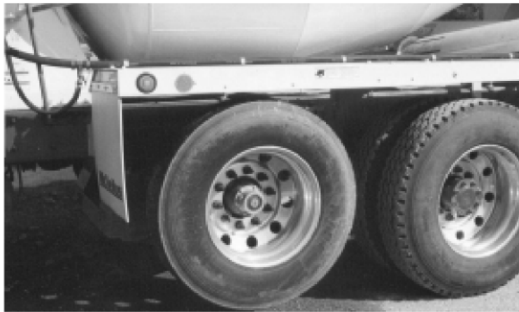
Figure 5-5: Check the tire pressure frequently. Under-inflation will greatly reduce tire life.

Tire costs are the second highest cost of running a truck mixer, with fuel being the most expensive. In the ready mixed concrete industry, more tires are ruined than worn out. Tire failure can cause delivery and schedule delays, unhappy customers, and even create a major