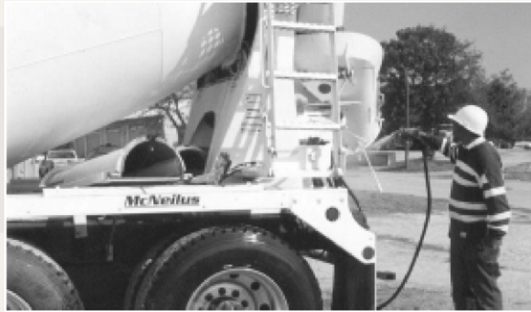
Figure 5-8: Cleaning should be performed on small areas of the truck using a diluted acid solution, then the area should be promptly rinsed.