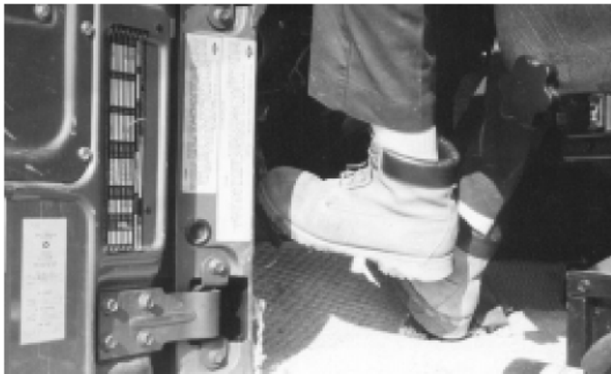
Figure 5-4: For safety purposes, the CDP must constantly monitor the brake system.

The brake system is one of the most important systems a CDP needs to monitor at all times (See Figure 5-4). The CDP's life and the lives of others depend on it. The brakes are activated by compressed air stored in the vehicle's air tanks from the air compressor. A series of lines