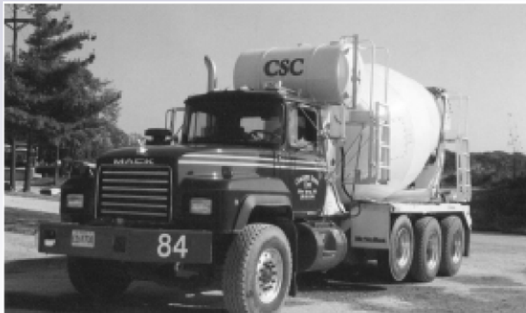
Figure 5-7: Keeping a clean vehicle instills pride of ownership for the CDP.

The value of a clean truck, both outside and inside, cannot be overemphasized. The truck mixer is a rolling billboard for the concrete producer and the CDP. The cleaner it is, the better it looks and the better the company looks. The CDP should also take pride in the appearance of the truck mixer and treat it as if it were his or her own vehicle. That pride in ownership is one of the things that separate the CDP from an average mixer driver (See Figure 5-7).