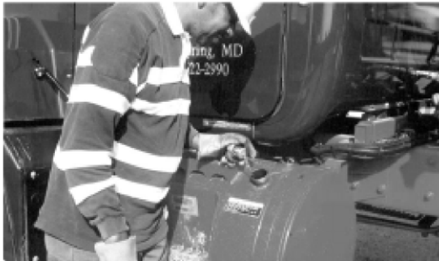
Figure 5-1: The CDP should not rely only on the fuel gauge within the cab. The fuel levels should be checked visually as well.

At the beginning of every shift, the oil should be checked as part of the pre-trip inspection. The CDP must know the location of the oil dipstick, as well as the location in the engine where oil may be added if it is low. The CDP should monitor the amount of oil that is added for excessive use, because it indicates engine trouble. If the oil is very dark or smells burned, there could be a problem with the engine. If there is water in the oil, it will turn a milky, brown colour. If the oil appears to be the consistency of water, it could indicate fuel dilution. Any of these conditions should be written up for maintenance.