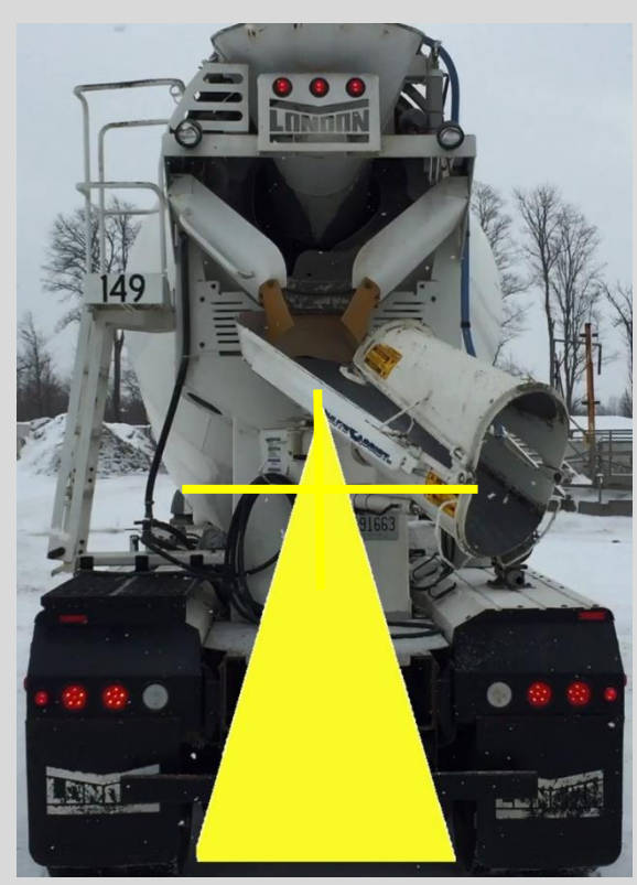
Drum Loaded (Not Rotating)

When the drum is not rotating, the concrete will sit at the bottom of the drum. The weight distribution is still high, however relatively centered over the middle of the truck.