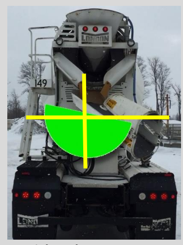
Higher Slump Concrete

The differences between high and low slump concrete and their effect on the trucks centre of gravity are shown below.